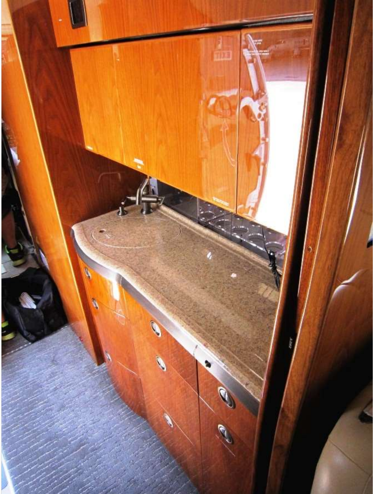
Specifications Subject to Verification Upon Inspection