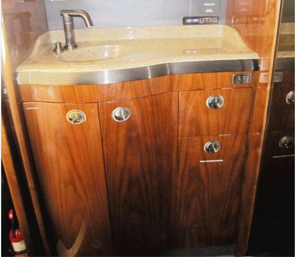
Specifications Subject to Verification Upon Inspection