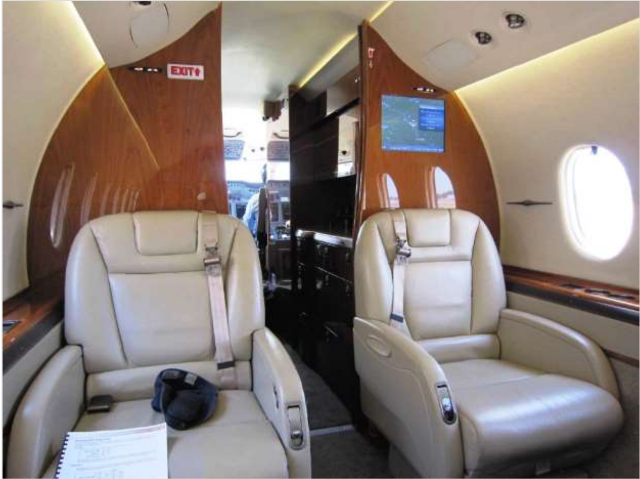
Specifications Subject to Verification Upon Inspection