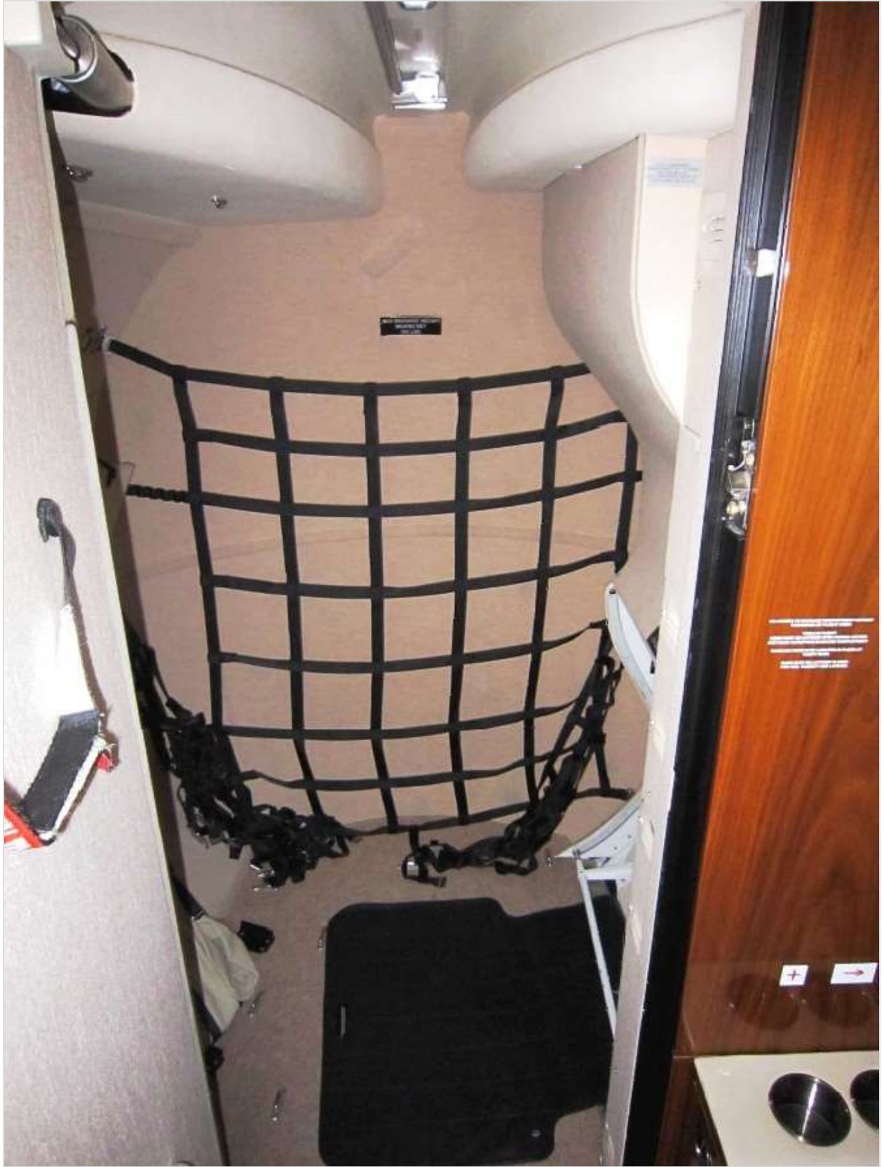
Specifications Subject to Verification Upon Inspection