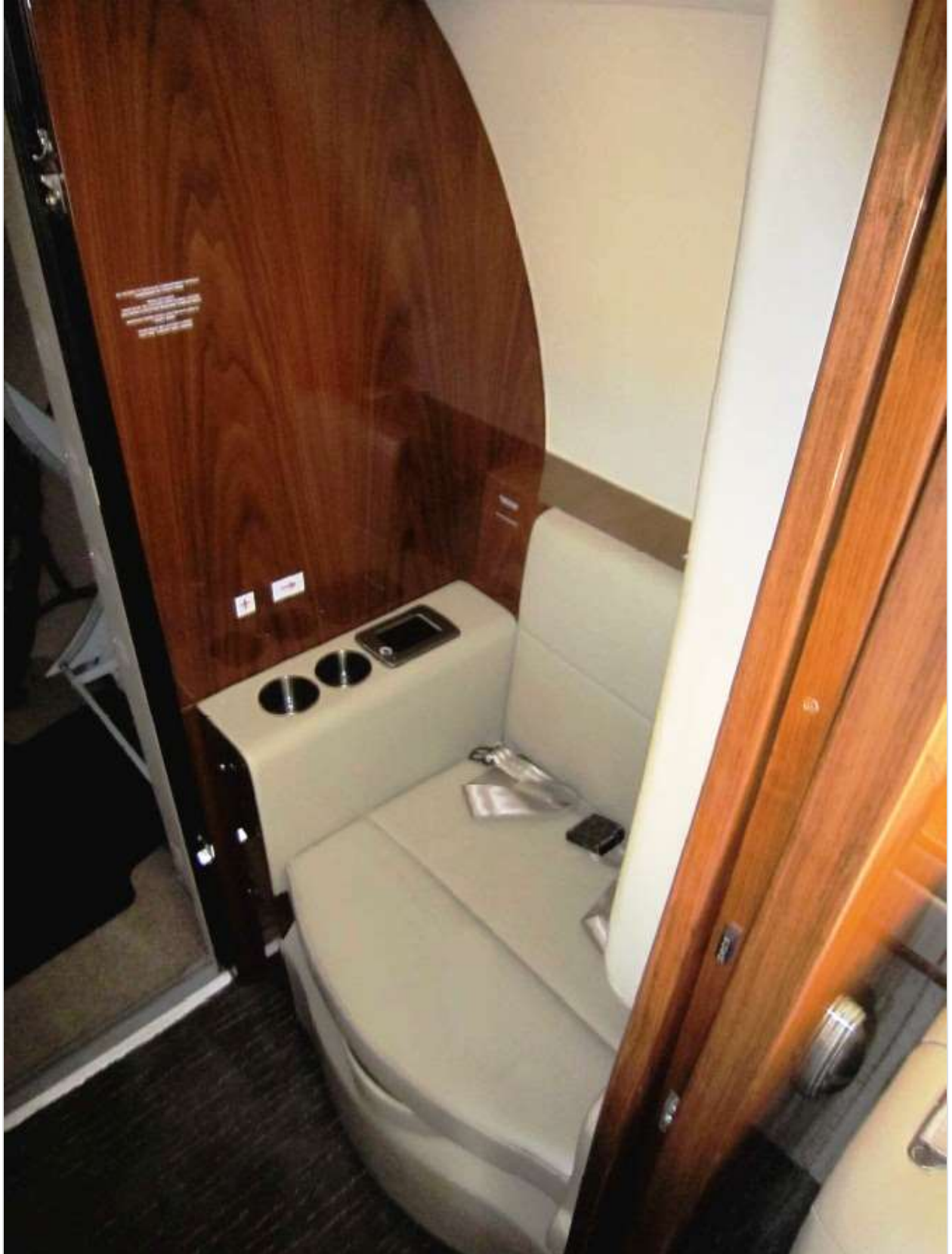
Specifications Subject to Verification Upon Inspection