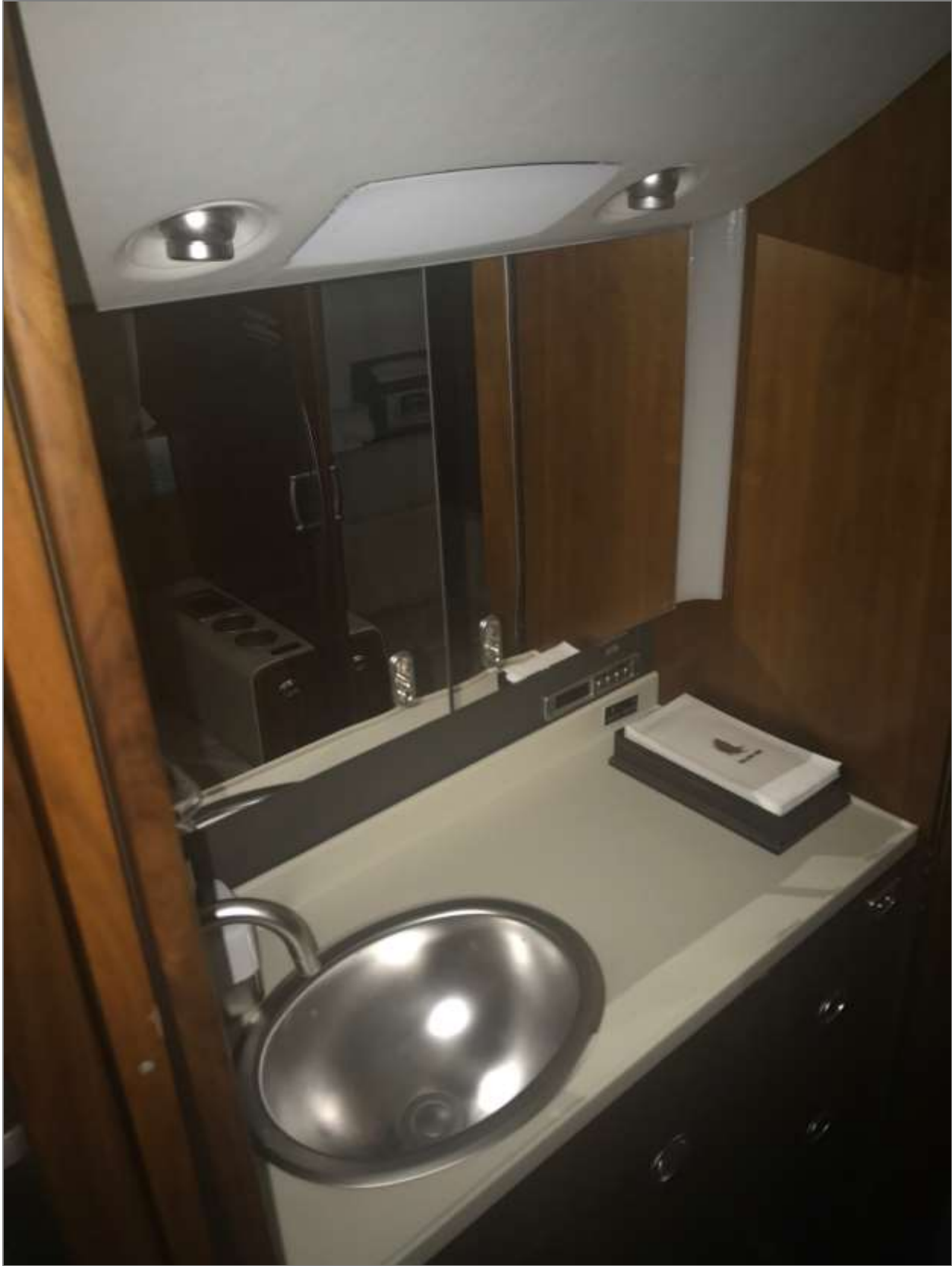
Specifications Subject to Verification Upon Inspection